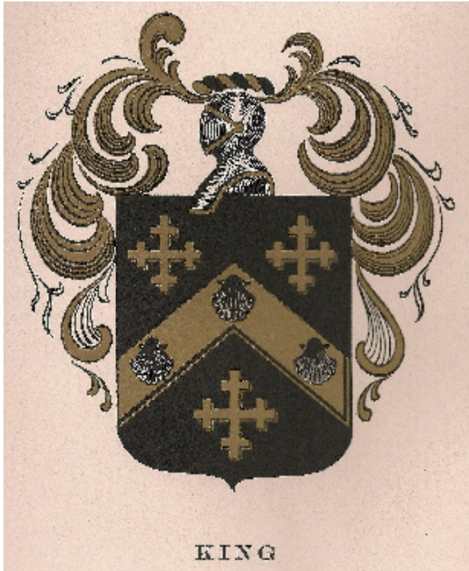
King of London achievement of arms sans crest.